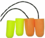
Semi-Pro Earpiece -- $49.95