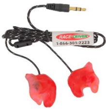
Custom Earpiece --$149.95

RACEceiver has 7 different earpiece options available. See http://raceceiver.com/earbuds.aspx