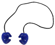
Earplugs with Lanyard -- $109.95